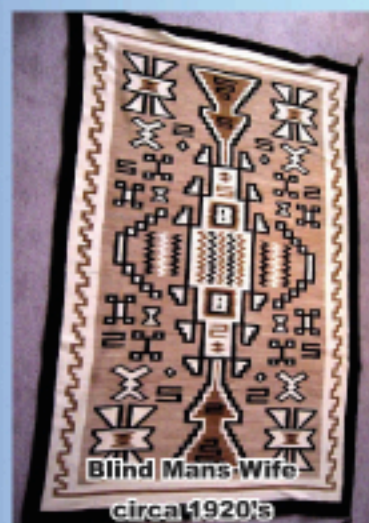
Blind Mans Wife circa 1920's